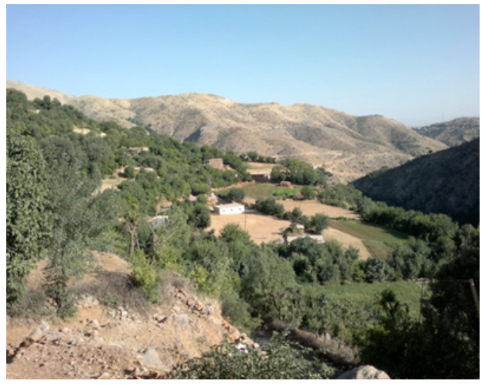
Figure 2. View of Tosunpınar Village (Kozluk District, Batman Province)

The plants that had been collected were identified by the authors using the Flora of Turkey and East Aegean Islands (Davis 1965-1985). Specimens were placed at the Herbarium of the Faculty of Pharmacy, University of Marmara (MARE).